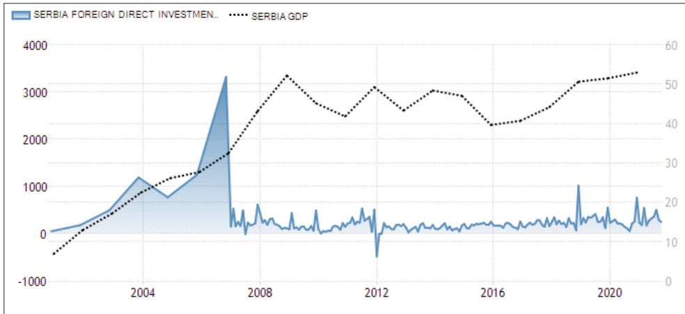
Graph 2. Movement of foreign direct investment (FDI) and gross domestic product (GDP) of Serbia in the period 2001 -2021. years

Based on the previous data, the movement of the index of economic freedoms and variables that build a given platform is visible. Also, the movement of the index of economic freedoms from 2001 is visible, from when the index of economic freedoms is calculated until 2019, 2020 and 2021 (the years affected by the corona virus COVID 19). Data on the movement of foreign direct investment (FDI) and gross domestic product (GDP) are given below.