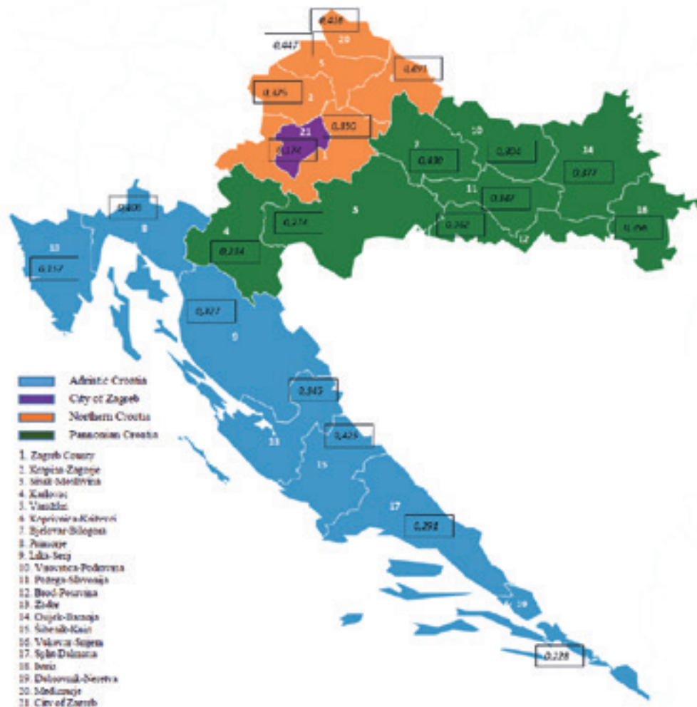
Figure 2. HHI by counties, average 2016-2020

Source: authors' calculation; Agency for Payments in Agriculture, Fisheries and Rural Development; Register of Agricultural Holdings.