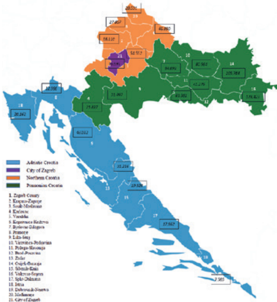
Figure 1. Area of selected areas by counties, annual average 2016-2020 (ha)

Source: authors' calculation; Agency for Payments in Agriculture, Fisheries and Rural Development; Register of Agricultural Holdings.