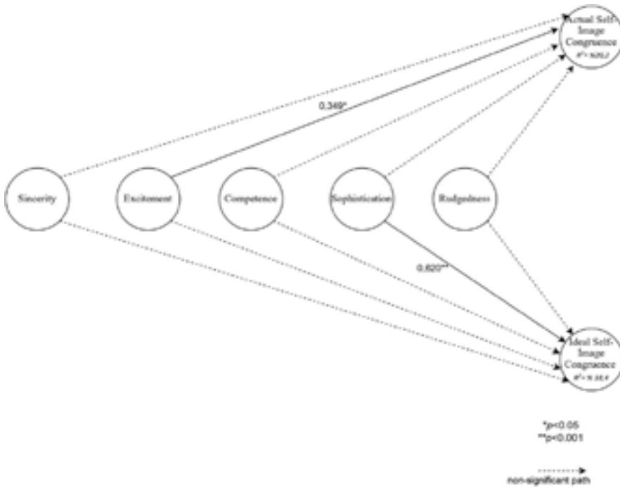
Figure 2. PLS results of the structural model